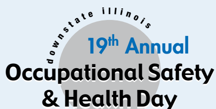
Exhibit Area Hours: 7 a.m.-3:10 p.m.

Take advantage of this opportunity to network with hundreds of other safety professionals and learn about resources available to downstate Illinois businesses and employers. In addition to governmental and nonprofit organizations, more than 40 other exhibitors will demonstrate many useful and innovative products and services to help accomplish your safety and health goals—and you can get your questions answered on the spot by knowledgeable company representatives. Be sure to bring plenty of business cards to network within the local safety and health community.